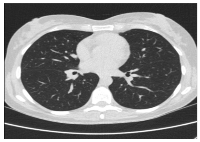
Figure 4: Follow-up chest CT scan at 24 months showing without residual tumor.

Following surgery, the patient initially reported complete remission of all symptoms. Follow-up was performed in January 2016 with a chest CT without any signs of residual tumor or metastases (Figure 4). Patient reported a few weeks of bone pain identical to that experienced prior to diagnosis of SFTP two years earlier. A PET-CT scan was completely without signs of recurrence or development of other pathological lesions including peritoneum and pericardium. She had no signs of vagal dysfunction. Blood alkaline phosphatase levels were normal, but blood sugar, HbA1c and X-ray imaging of upper and lower extremities were without remission. A multidisciplinary team conference involving thoracic surgeon, chest physician, radiologist and pathologist concluded that there were no signs of relapse, and that the patient should continue routine follow-up with chest CT and blood samples annually. She was referred for evaluation by a rheumatologist but the patient cancelled the appointment as the bone pain resolved spontaneously within 6 weeks. At follow-up in February 2017, she was completely asymptomatic, with normalized blood samples including HbA1c and her CT were without any signs of relapse.