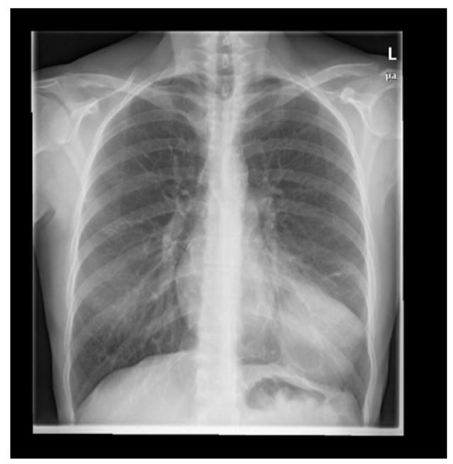
Figure 1 : Initial chest x-ray from 2013 with a mass (arrow) interpreted as "non-specific findings" in left hemithorax.

A 43-year-old Caucasian female was referred to department of internal medicine by her general practitioner in March 2014, to rule out rheumatic disease due to symptoms from her locomotor system. Onset of symptoms started three years earlier when she experienced intermittent pain and swelling from knees, ankles and toes. Eight months prior to referral, she developed symmetrical clubbing of fingernails, monthly night sweats and malaise, but no weight loss or dyspnoea. She was a never-smoker, and the medical history was unremarkable. A chest x-ray performed in 2013 was described as "non-specific changes in the left hemithorax" (Figure 1), but a follow-up was never performed due to miscommunication.