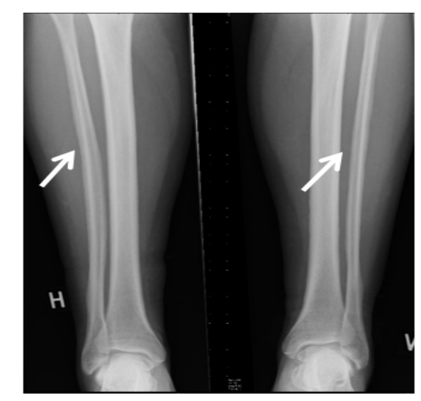
Figure 3: X-ray showing non-specific periosteal thickening (arrows) of the right (H) and left (V) fibulae.